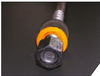
Orange: Suit 1.225 to 1.500[m] bolts.