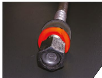
Red: Suit 1.525 to 1.800[m] bolts.