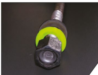
Green: Suit 1.825 to 2.100[m] bolts.