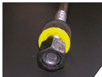
Yellow: Suit 2.125 to 2.400[m] bolts.