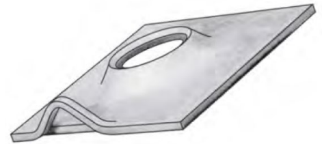
DOMES PLATE WITH HANGING LOOP